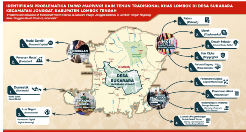
Figure 3. Mind Mapping of Lombok Traditional Weaving Activities in Sukarara Village

Rambitan Village needs strategic steps in developing traditional weaving. Strategic steps start from developing the quality of weaving produced from traditional production to fulfill the experience of tourists who first know about weaving. Apart from that, improving the production quality of weaving techniques, dyes, motifs, and designs/models issued in accordance with the interests of visiting tourists.