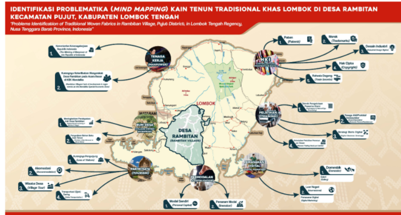
Figure 2. Mind Mapping of Lombok Traditional Weaving Activities in Rambitan Village